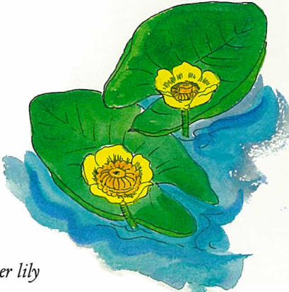
Yellow water lily